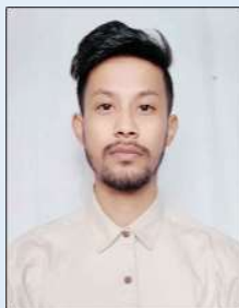
Admin Officer & Secretary

MA, DCWE. Has been a college professor for over 15 years. She is also a freelance author and has published on many social issues in the media. One of her works is published by the National Book Trust.