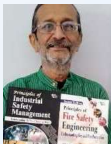
Chairman & Professor Emeritus, Governing Body