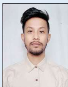
Admin Officer & Secretary of GB

MA, DCWE. Has been a college professor for over 15 years. She is also a freelance author and has published on many social issues in the media. One of her works is published by the National Book Trust.